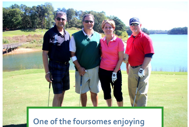
One of the foursomes enjoying the golf outing